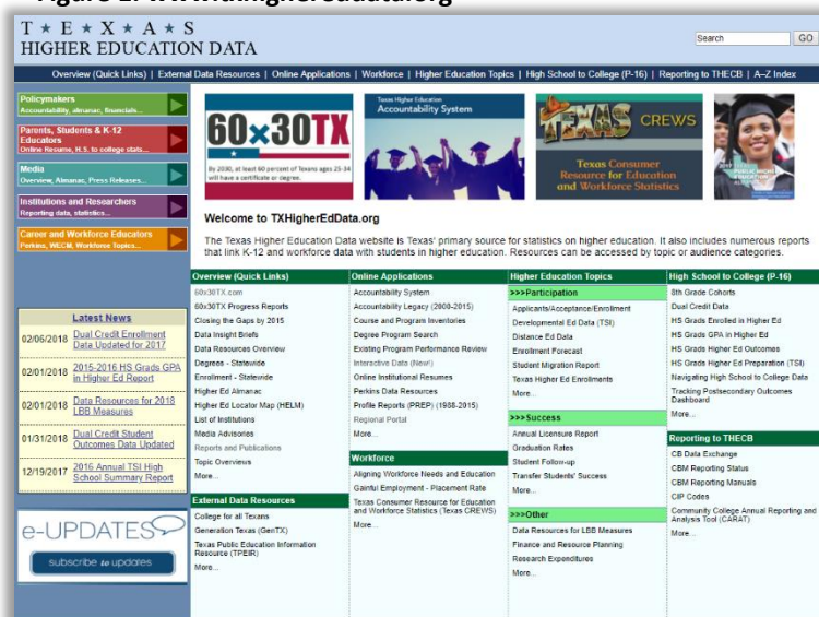
Figure 1. www.txhighereddata.org

The Texas Higher Education Data website offers policymakers, students, parents, K-12 educators, media, researchers, and faculty a collection of education data designed to help shape policy and inform initiatives that will move Texas closer to achieving the goals of the 60x30TX strategic plan and will lay the foundation for a globally competitive workforce.