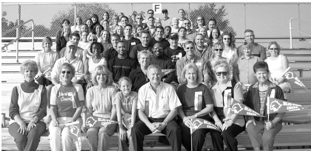
Former students representing five decades of HCJC/TVCC spirit gathered for homecoming in the fall for the first Cardinal Cheerleaders Reunion.