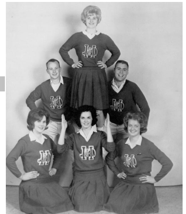
1964 Cardinal Cheerleaders

We'll provide the food and the entertainment.