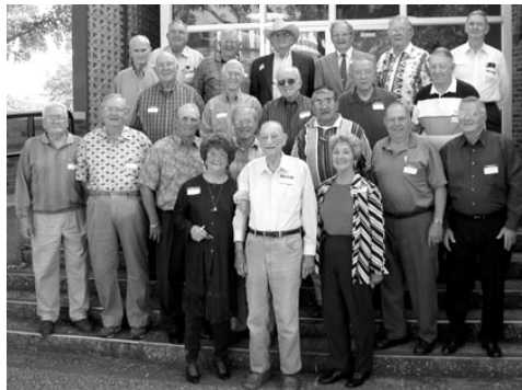
TVCC's first football team held a reunion on the campus during Homecoming last year.