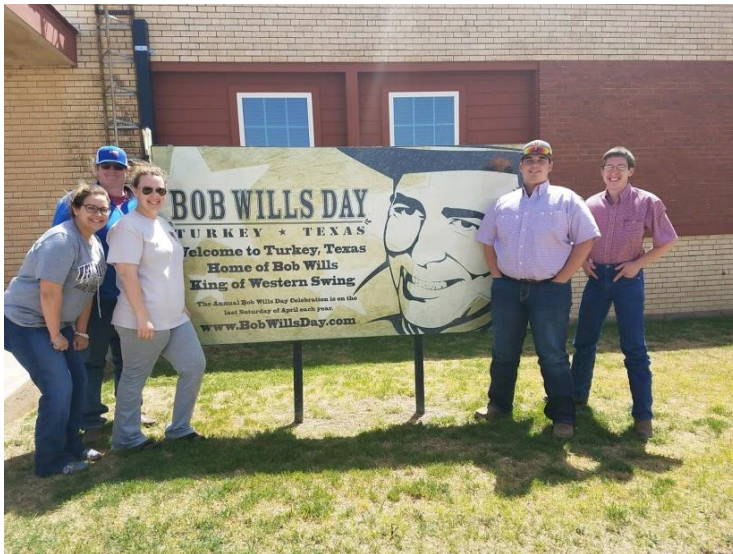
Photo at left was taken in front of the Bob Wills Museum in Turkey, Texas.