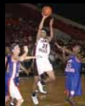
TVCC is an affirmative action/equal opportunity institution.